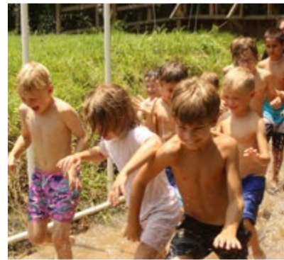
WILD WATER DAY

On Goofy Game Day, campers enjoy all kinds of exciting and funny games to help them get to know the other campers better in a fun and low-pressure way.