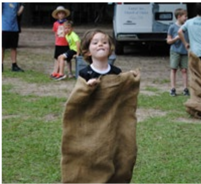
GOOFY GAME DAY

Each day at Camp has a theme. Along with each theme comes different group activities, fun costumes, and special traditions. Here's a quick introduction to each of the theme days, including tips on special clothes or costumes you might want to pack! Of course, it is completely optional to dress up for theme days.