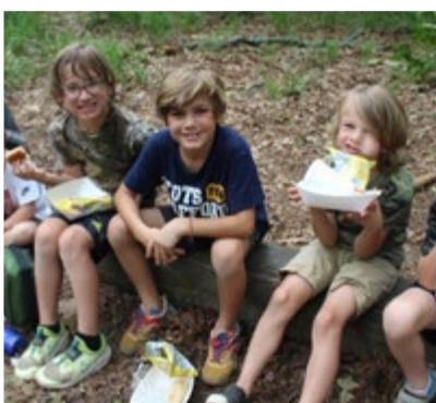
CAMO COOKOUT DAY

Time to head to the creek! On Wild Water Day, the PeeWees take over Killi Creek for lots of splashing and water games - the main event is the "PeeWee Carwash!" Please send an extra shirt for your camper to wear over their swimsuit in the creek.