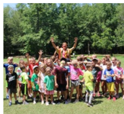
CRAZY COLOR DAY

You don't need to pack a lunch for your camper on Wednesday, because we're headed out into the woods for a good old fashioned hotdog cookout. Since we'll be out in the woods, it's a great day to wear Camo!