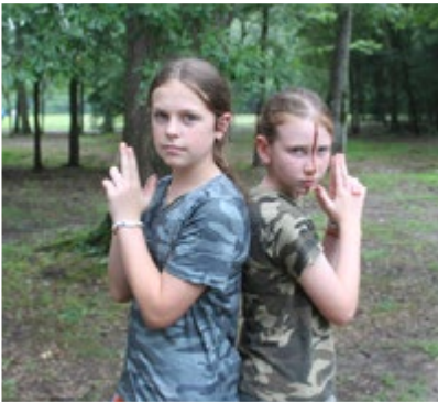
CAPTURE THE FLAG DAY

Anything western goes with this day - pearl snaps, cowboy hats, boots, etc. Just make sure to bring clothes that can get wet!