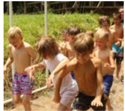
WILD WATER DAY

You don't need to pack a lunch on Wednesday, because we're headed out into the woods for a good old fashioned hotdog cookout. Since we'll be out in the woods, it's a great day to wear Camo!