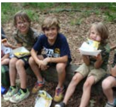
CAMO COOKOUT DAY

On Goofy Game Day, campers enjoy all kinds of exciting and funny games to help them get to know the other campers better in a fun and low-pressure way.