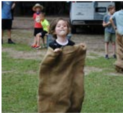
GOOFY GAME DAY

Each day at Camp has a theme. Along with each theme comes different group activities, fun costumes, and special traditions. Here's a quick introduction to each of the theme days, including tips on special clothes or costumes you might want to pack! Of course, it is completely optional to dress up for theme days.