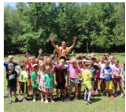
CRAZY COLOR DAY

Time to head to the creek! On Wild Water Day, the PeeWees take over Killi Creek for lots of splashing and water games like the "PeeWee Carwash!"