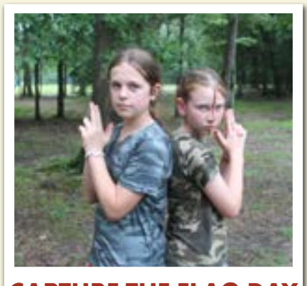
CAPTURE THE FLAG DAY

Flowery shirts, grass skirt, leis, etc. This is a day full of water activities, so you'll need clothes you don't mind getting wet.